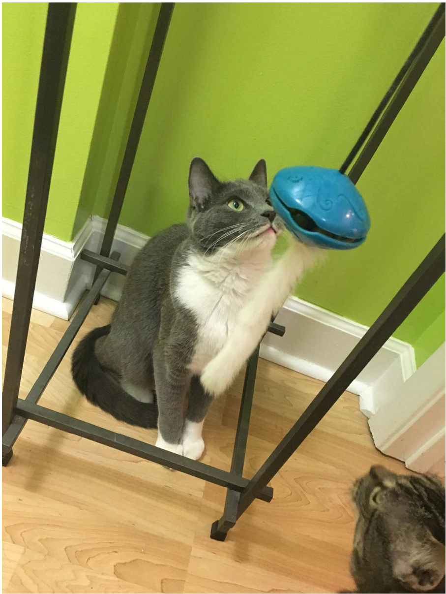
A piñata-style puzzle that hangs. 127x169mm (300 x 300 DPI)