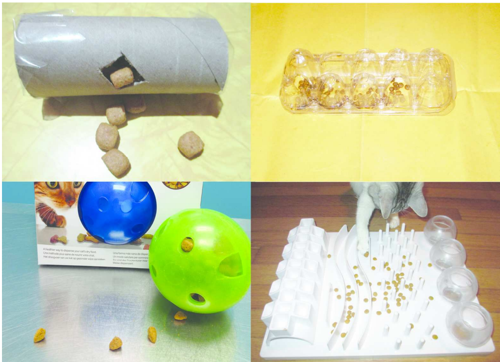
Clockwise from upper-left hand corner: homemade mobile, homemade stationary, purchased stationary, and purchased mobile food puzzles. 169x122mm (300 x 300 DPI)