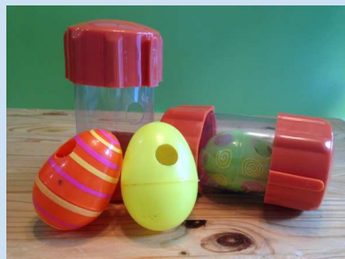
Some examples of rolling food puzzles.

Food puzzles are an excellent way to increase your cat's activity and mental health by giving them a new, more natural way to get their food by "hunting" for it. Food puzzles typically come in two styles, rolling and stationary. They can be purchased or homemade, and can be used with dry or wet food, or treats.