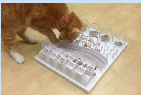
Stationary puzzles can be used with wet and dry food.

For slow starters , place small handfuls of dry food in locations frequented by the cat (condos, window sills, beds.). This allows the cat to discover food in novel places.