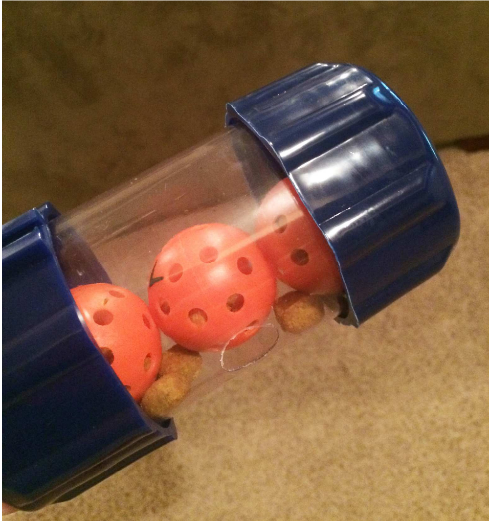
Placing a small puzzle inside a larger puzzle increases challenge for cats. 158x169mm (300 x 300 DPI)